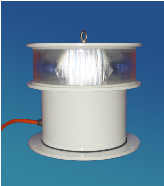
picture with integrated electronic (electronic ballast and twilight switch)