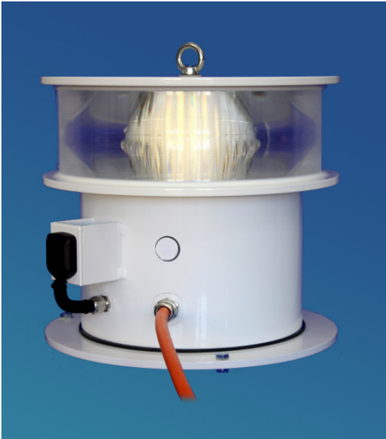
picture with integrated electronic (electronic ballast, twilight switch and GPS module)